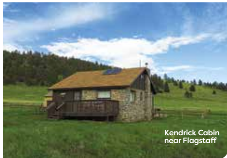
Kendrick Cabin near Flagstaff