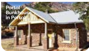
Portal Bunkhouse in Portal